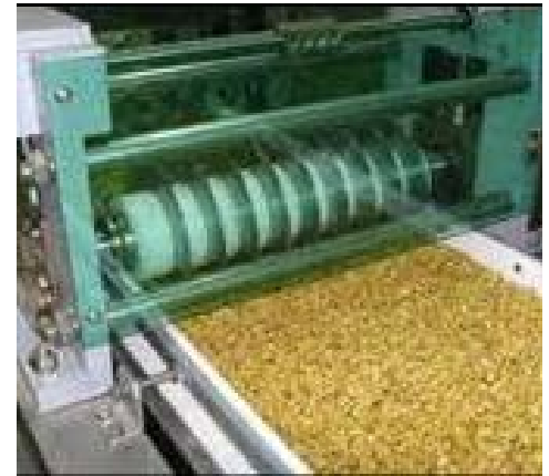
Roller showing extrusion of the product into long strips before cutting into bars.

Bronkhorst Cori-Tech understands the market needs and can provide customized solutions to control the precise addition of flavours, fragrances or other additives.